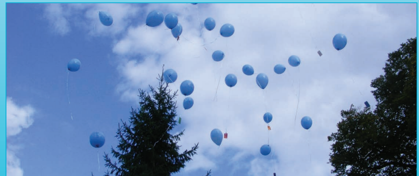
Children and their families enjoyed an afternoon of games, craft and face painting in the Walled Garden at Fox Lease, Lyndhurst. Balloons were released with individual special messages to loved ones who had died.